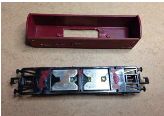
5 Remove the metal weights from the base. Use the hole you made in the van body as a guide to cut the same size hole in the base