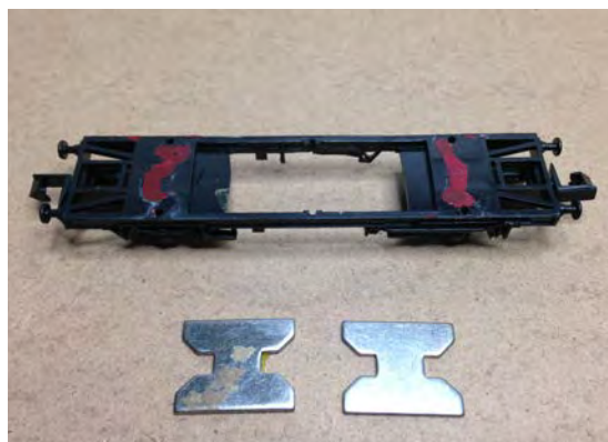
6 Be careful not to break the sides of the base