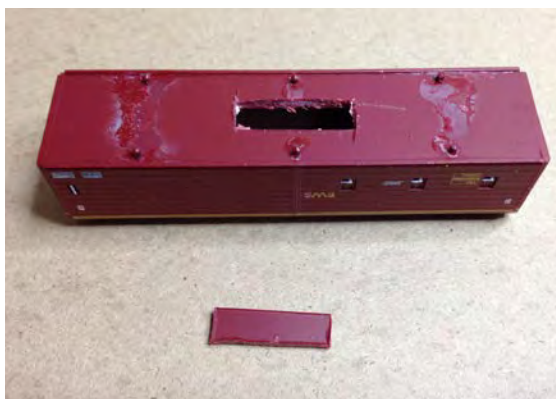
3 Using a craft knife or mini saw carefully cut a small hole in the centre of the body floor. This is just an initial hole which will be made larger in the next stage