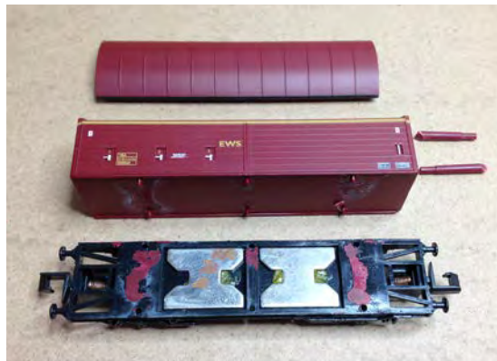
2 Remove the body from the base - on this model it was glued on. I also cut off the roof mounting posts to give more room inside