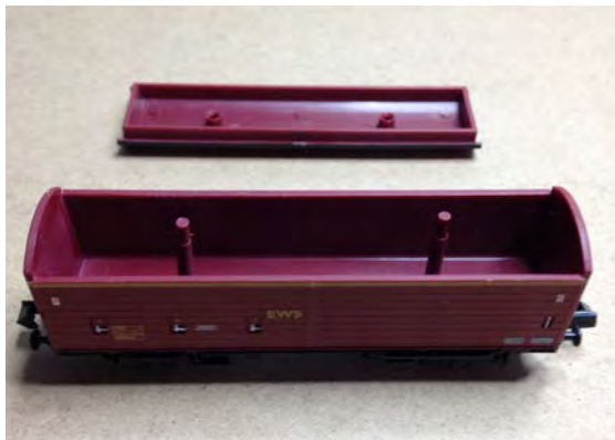
1 First remove the roof of the van body

The idea is to make a hole in the base of the van so that part of the SFX underhangs between the wheels. You probably need to use a long wheelbase wagon - we used a Graham Farish 373-053B VBA Box Van EWS